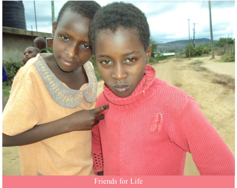
Friends for Life

S HERP is an organization devoted to giving children with disability the chance for a happy and healthy life. We support 154 children on-site with disability who cannot be supported by their families, and in total nearly 400 children with disability across the Samburu county.