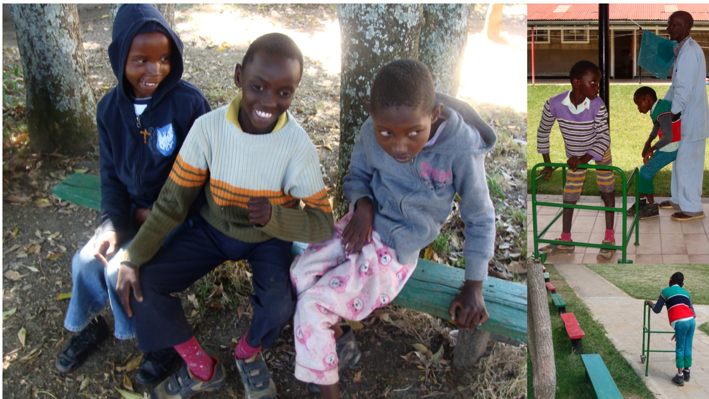
Above, some of the children pictured enjoying themselves and engaging in physical therapy at Ol'Kalou Disabled Children's Home

Keeping Our Children Happy, Safe, and Strong!!