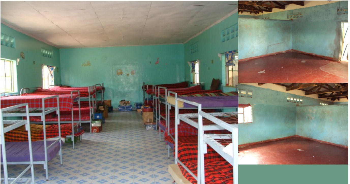
Above, before and after pictures of the boys' dormitory

Renovated Dorms and Plans to Renovate Toilets and Bathrooms