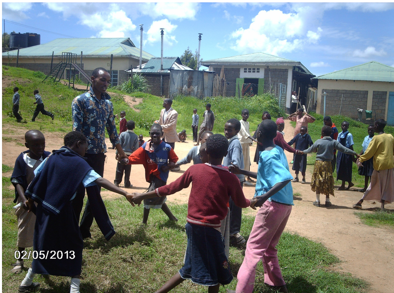
Children playing together on SHERP's field

T he Compassion School came for a visit with our children on the 19 th of April! Bringing together all children for them to accept each other, regardless of differences. The children played together on SHERP's field and finished the day in our hall with balloons, juice, biscuits, and candy. They left SHERP after offering up a song and a prayer for the children here. This first meeting was appreciated by all and we hope to one day take our children to their classroom and to continue this relationship into the future.