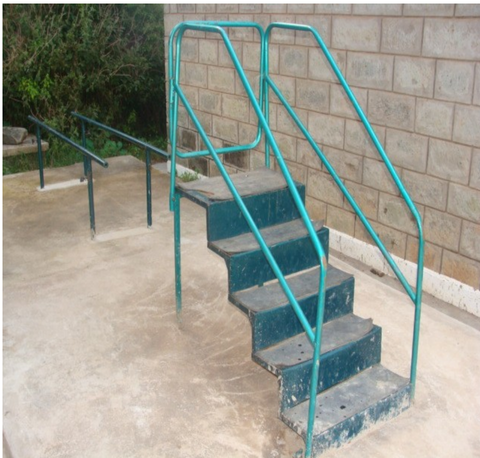
SHERP's small, but growing, physical therapy area!

W e thank Therese Smeets for her extra donation this quarter which assisted in fixing the children physiotherapy equipments and a beautiful shade (still to be fixed) which will help our cerebral palsy children exercise more freely and ease congestion in our special class.