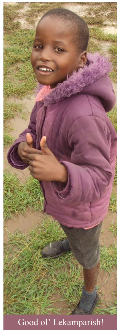
Good ol' Lekamparish!

Our quarterly newsletters seek to inform and educate our donors and friends about the work taking place at SHERP. We are attempting to document our successes, struggles and our need for your continued support and help, without which the remarkable success of the children here would not be possible. Please enjoy reading this newsletter, forward it to friends and colleagues and don't hesitate to get in touch with us!