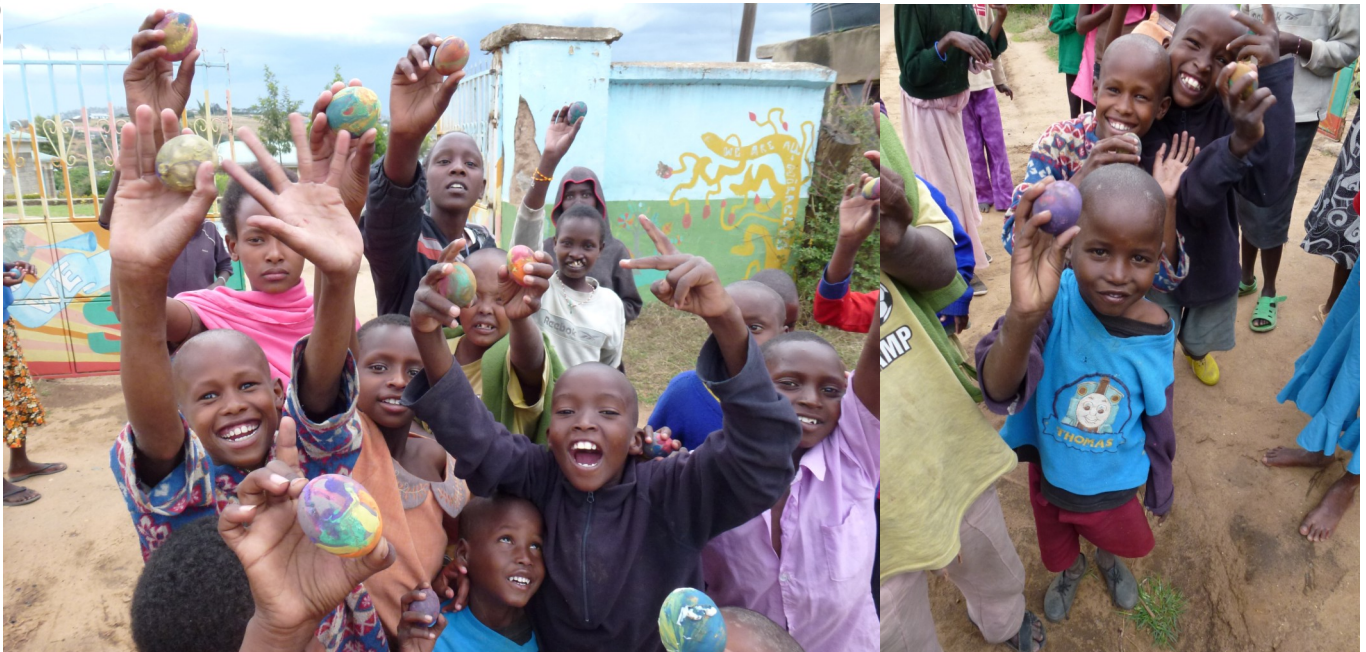
The children proudly showing off the eggs that they painted and hunted down!

Hunting for Eggs, Playing with Friends, and Enjoying Our Time Together