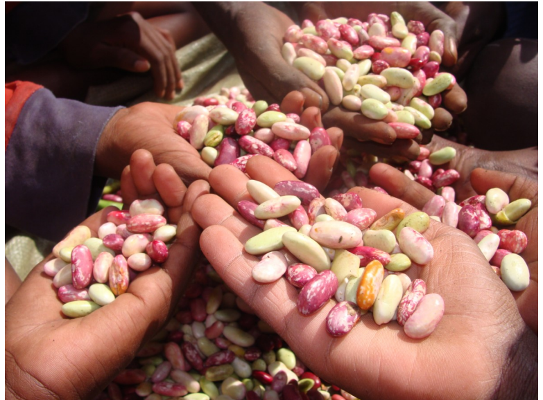
Our delicious beans!

We harvested several dozen kilograms of beans from our shamba (garden) during our latest harvest! With the aid of good rainfall (and, we like to think, of good management) our beans turned out to be large, healthy, and absolutely delicious. The children enjoyed eating them with ugali and sukuma wiki. We have plans in place to plant more for next year!