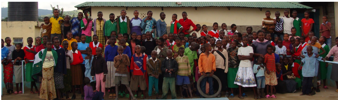
Children of St. Mary's, along with SHERP children pose after a hard morning of chores