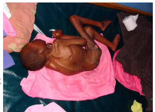
One of the ten children that was dropped off, severely malnourished and sick

Sadly, this case highlights yet again the need for SHERP to grow and become self sustainable in order to serve many more children.