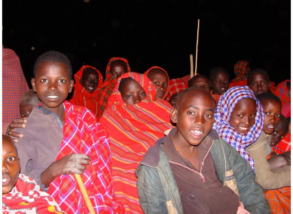
Top, a group photo of the women that we trained during the day Bottom, some of the children that came out at night to hear about disability