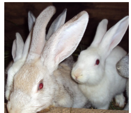
A few of our surviving rabbits

Sadly, our rabbit project is not yet successful. We have lost a large number of our teenage rabbits before we were able to eat them. This loss is possibly due to cold and definitely due to inexperience. Hopefully, we will be learning from our mistakes and will have better news to report soon!