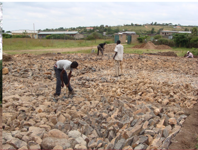
Preparation for the construction of the Safaricom Cottage

Construction has finally finished on two more of our cottages! As our long term supporters will know, SHERP is currently attempting to undertake major efforts towards self sustainability. We are slowly realizing this dream and this quarter witnessed the construction of the cottage unit pictured above. The income generated from these cottages will go a long way towards providing the children with a steady source of funds needed to pay for food, school fees, and other basic needs. Currently, we expect to have the ability to construct one cottage using approximately 17,000 US dollars. This money would pay for one structure with two self contained rooms. Again, we would like to thank SHERP NL, Wilde Ganzen, Rotary Club ter Aar and all of their supporters for their donations and support. Plans are also in the works for these three supporters to give additional funds in order to construct one cottage unit with three self contained living quarters. If this plan commences we will have the a ability to finance