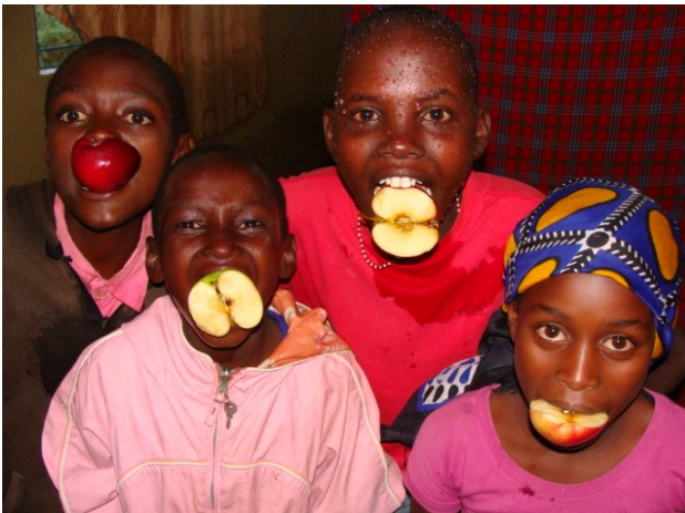
The winners of the apple bobbing contest!